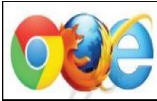
Some Internet Browsers